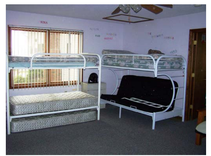
Large bunk room for the troops!