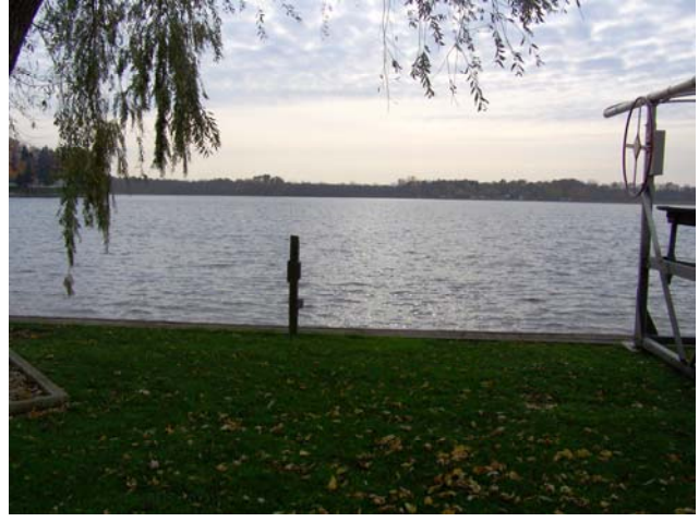
Sunsets & great view.