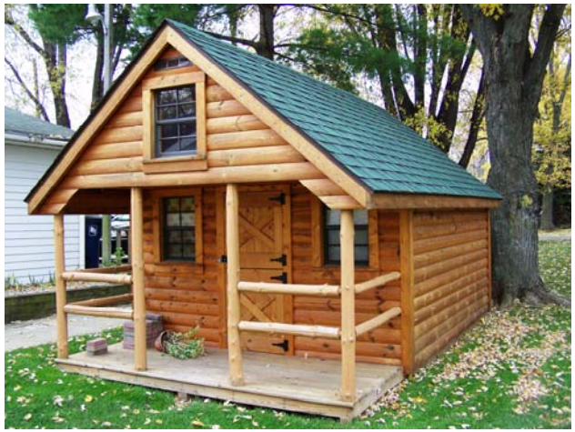
Custom Kid's Play house!