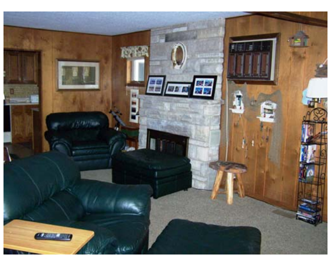
Fireplace & living room.